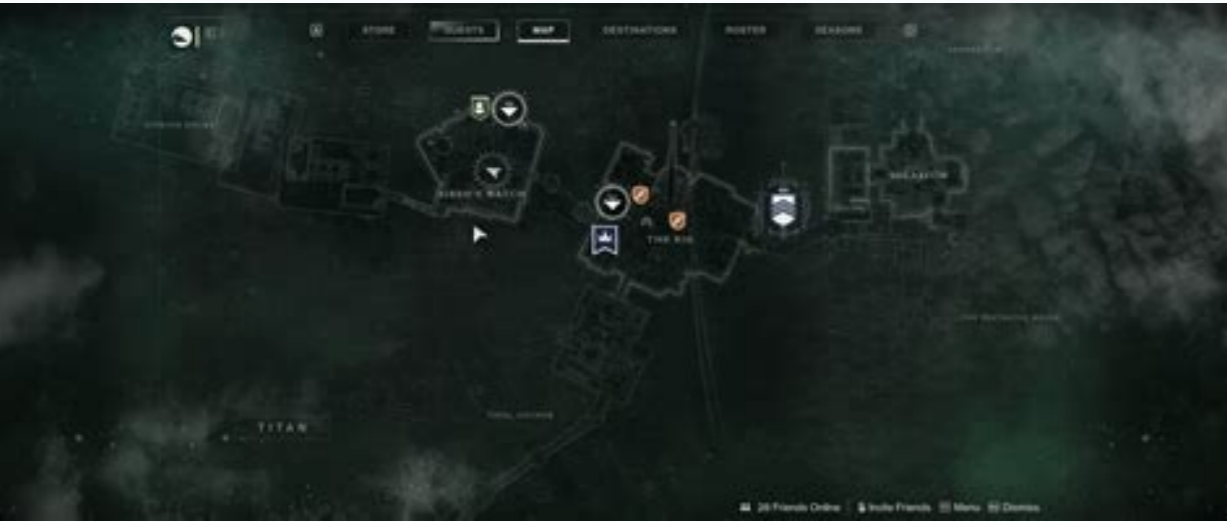
Lost sector methane flush destiny 2. Methane flush destiny 2 location. Destiny 2 methane flush lost sector location.